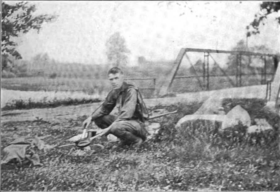
OUT AT THE FIRST STREAK OF DAWN, A BIT OF FISHING, A QUICK PADDLE DOWN TO THE OUTLET, AND BREAKFAST BY A PILE OF TIES AGAINST A BACKGROUND OF AN IRON BRIDGE

credulity, and they remain on the bank waiting for us to ingloriously sink, and, like enough, turn away disappointed when we disappear around the bend with a wave of our paddles.