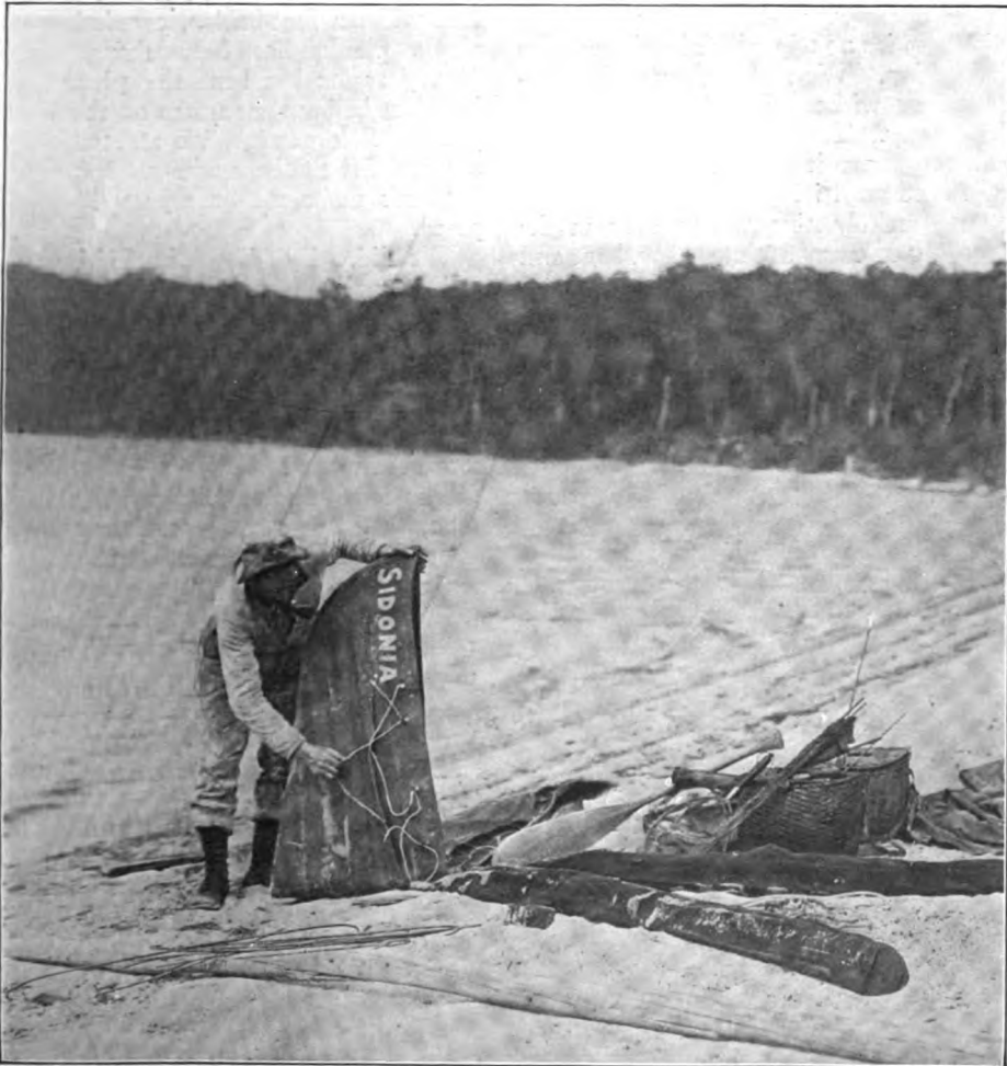
TO UNPACK THE BOAT AND SET IT UP IS ONLY A FIFTEEN-MINUTE JOB ONCE YOU GET THE HANG OF IT